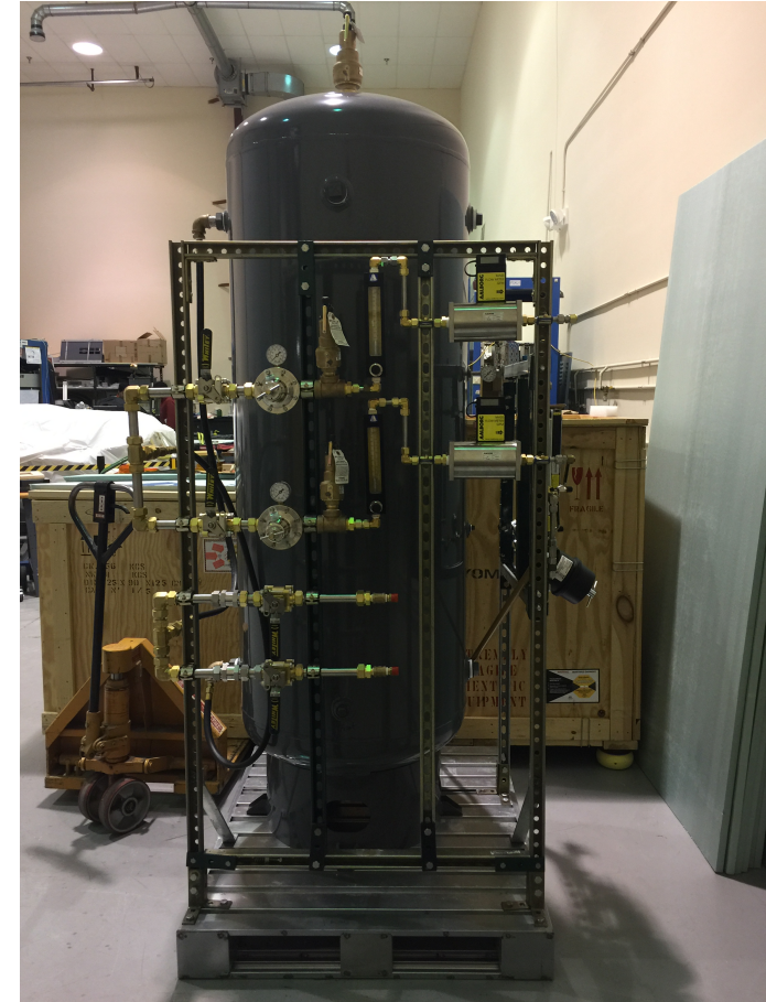
Gas system on level 4: compressors (Left) tank + panels (Right)