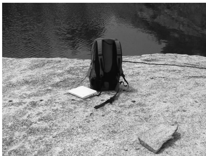
Fig. 1 – Portable gamma-ray spectrometer.

To discriminate among different intrusions, which are generated from different magmatic pulse in composite batholiths made up of coalescent plutons, is not an easy task, particularly if different intrusions with similar petrofacies come into contact.